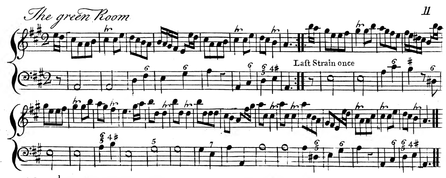
First & 2<sup>d</sup> Man foot it to their Partners & turn them to the Man's Side — then foot it to their Partners and turn each into their Places — First Cu. cast off one Cu. & lead up footing it to the Top & cast off to the 2<sup>d</sup> Couple's Place — then the first Cu. foot it to the 2<sup>d</sup> Cu. then to themselves & turn —